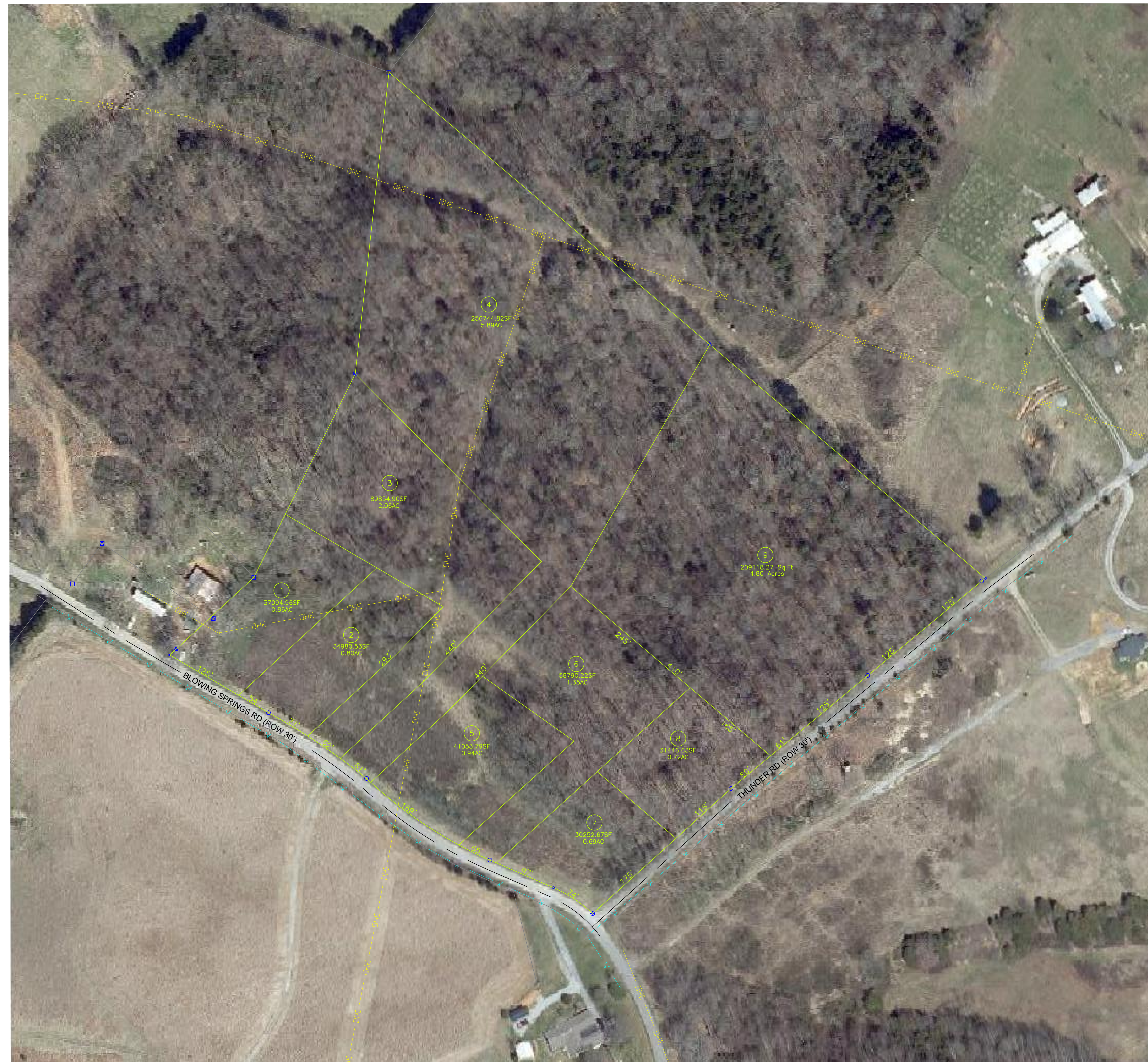
EXHIBIT ONLY - NOT FOR RECORDING OR LAND TRANSFER